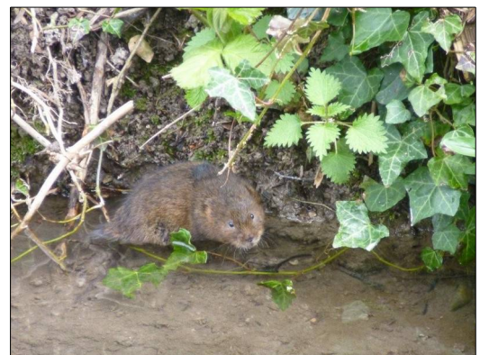
Photo of water vole

11 th August A single active water vole feeding and swimming around both at 11 AM and at 4 PM on 11/8/2015. Both sightings were at the same spot about half way along the path from Burnside to Sainsbury at the point where the stream is wide and relatively free from vegetation except at the banks. It is wonderful to be able to see the great variety of wildlife in a city (little egret, kingfisher, muntjac etc.) that the Brook provides. Thanks for all your work.